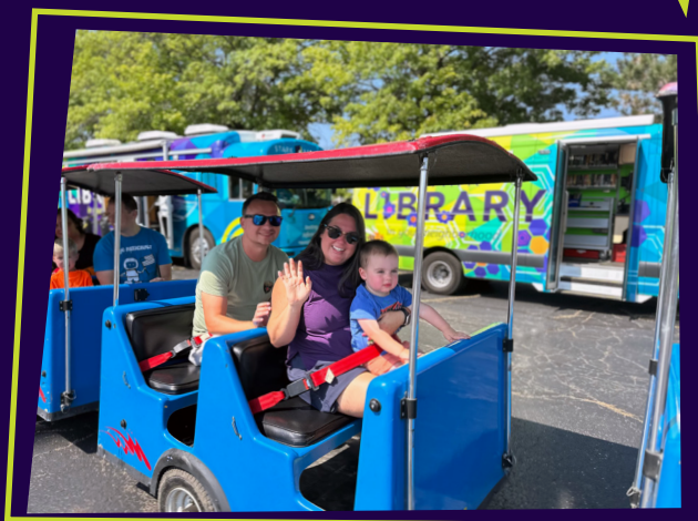
A family enjoying a train ride at our Annual Touch-a-Truck Extravaganza, taking place for the first time at Temporary Main Library (parking lot).

We connected with 14,930 people through outreach and promotional events in the community.