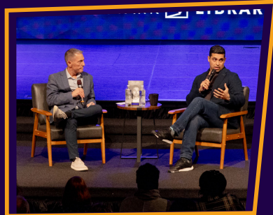
Actor, producer, and entrepreneur Wilmer Valderrama at the Speaking of Books Author Series on March 6, 2025.

The 11th season of the Dr. Audrey Lavin Speaking of Books Author Series brought 3,958 community members together in 2025 for inspiring conversations with authors of every genre.