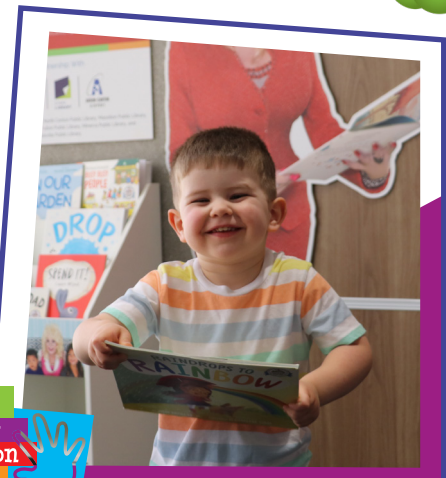
Taken at Akron-Canton Airport during the unveiling of Stark Library's, the Akron-Canton Airport's (CAK), and Imagination Library's Flybrary initiative.