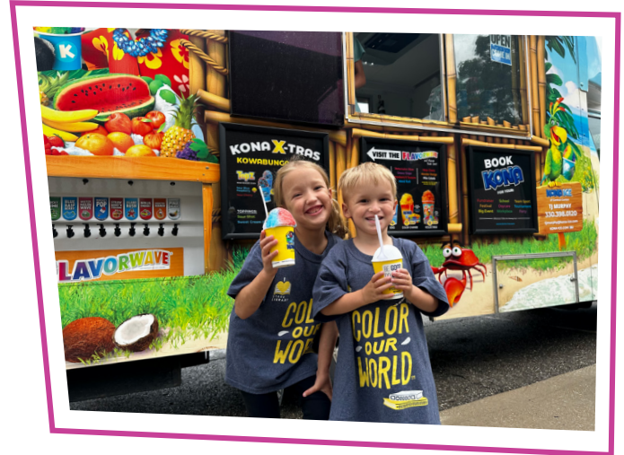
Two participants enjoying shaved ice at our North Branch during our Summer Challenge Finale, proudly wearing their Summer Challenge T-shirts